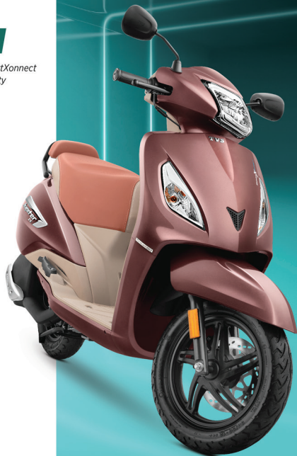
FRONT & REAR LARGE 12 INCHES ALLOY WHEELS