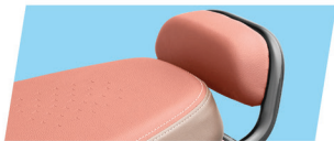
PREMIUM SEAT WITH PILLION BACK REST

TVS Jupiter ZX SmartXonnect is loaded with novel features that are aesthetic in appeal and advanced in technology. The dynamic design is thoroughly thought through to deliver a riding experience unlike any other.