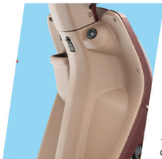
NEW SILVER OAK PANELS

Ensure more comfort for your pillion as you ride with a thoughtfully designed pillion back rest