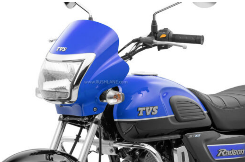
New TVS Radeon

New Radeon looks to improve upon the equipment list of Splendor+ XTEC that has multiple segment-first features