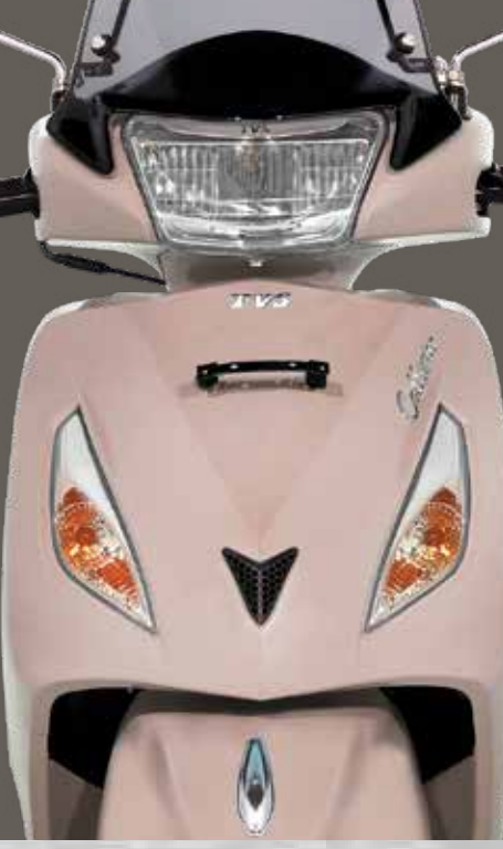
NEW AND REFRESHED FRONT AND SIDE DECAL PANELS