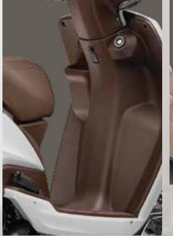
DUAL TONE INNER PANELS