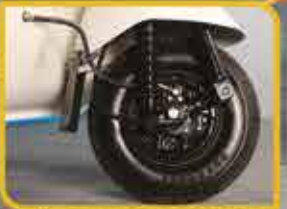
TUBELESS TYRES NO SUDDEN BUSINESS STOPPAGE QUICK & EASY TYRE REPAIR