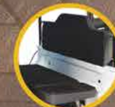
KING SIZE DRIVER SEAT