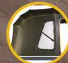
THICKEST QUALITY CANOPY