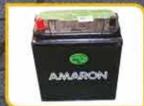
MAINTENANCE FREE BATTERY ADVANCED AGM BATTERY FOR HIGH POWER OUTPUT & EXTENDED LIFE