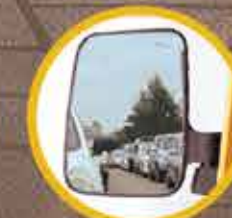
LARGE FOLDABLE MIRROR