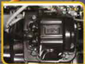
SUPER DURABLE ENGINE REFINED COMPONENTS WITH ALUMINIUM CYLINDER BLOCK