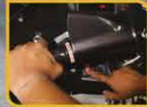
ALL GEAR START QUICK EFFORTLESS START IN ANY GEAR