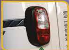
TRENDY TAIL LAMP PLEASANT JEWEL TYPE LIGHT PATTERN