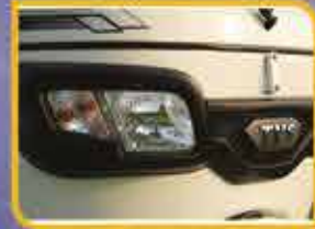
STRIKING NEW GRILL 3 LAYER HONEYCOMB DESIGN, DASHING 3D LOGO