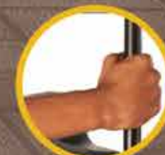
HEAVY DUTY PILLARS