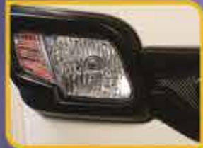
BOLDER HEADLAMP & BEZEL STURDY LOOK, MORE VISIBILITY AT NIGHT