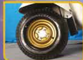
PREMIUM WHEEL RIMS ROYAL LOOK IN TITANIUM GOLD COLOUR