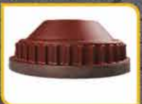
SHARPER, MORE DURABLE BRAKES IMPROVED BRAKE DRUM, CYLINDER & PEDAL