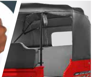
Thickest in class canopy