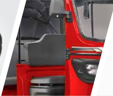
King size Driver Seat