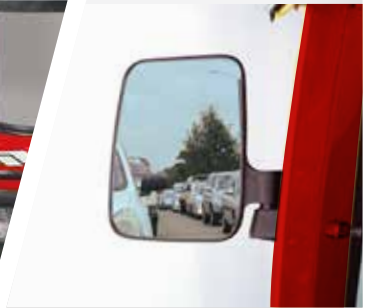
Large Foldable Mirror