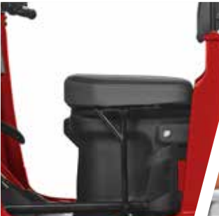
Large Lockable Storage