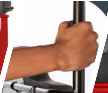
Heavy Duty Pillars