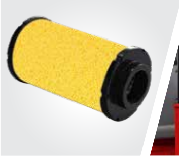
3 Stage Air Filtration