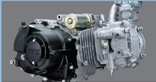
RELIABLE & FUEL EFFICIENT ENGINE