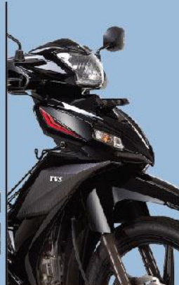
Black - Red