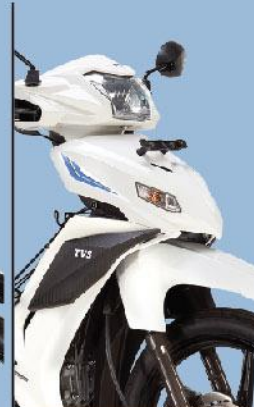
White - Blue