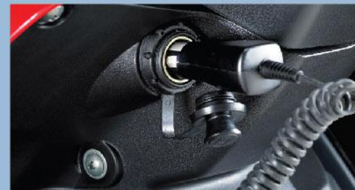
USB MOBILE CHARGER