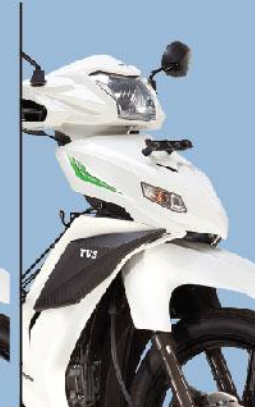
White - Green