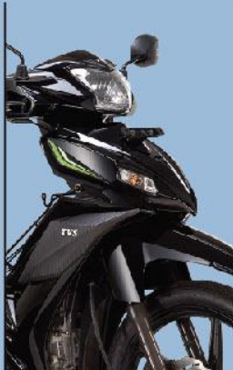
Black - Green