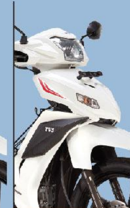
White - Red