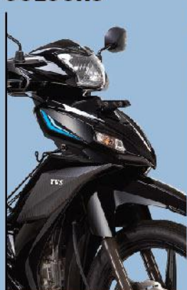
Black - Blue