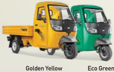
Golden Yellow Eco Green