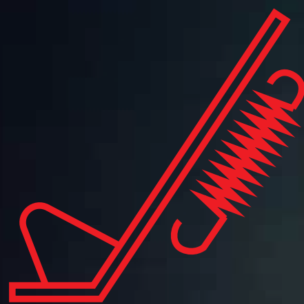
SIDE STAND INDICATION AND ENGINE CUT-OFF