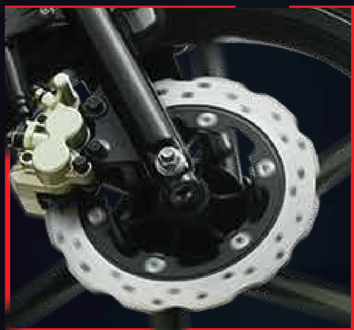
ROTOPETAL DISC BRAKE