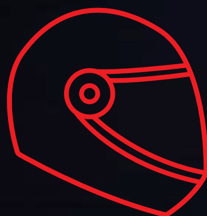
HELMET ATTENTION INDICATION