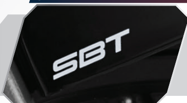
SYNCHRONISED BRAKING TECHNOLOGY