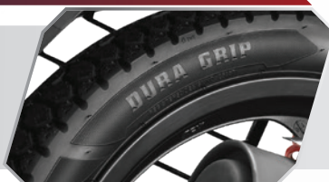
DURA GRIP TYRES