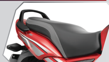
PREMIUM DUAL TONE SEAT