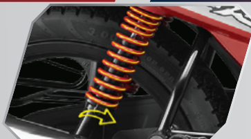
COLOURED 5-STEP ADJUSTABLE SHOCK ABSORBERS